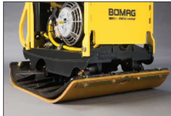
The Vulcolan mat helps avoid damage to paving stone surfaces.