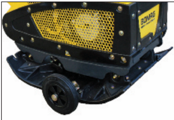
The transport wheels allow for one-person movement around the jobsite.