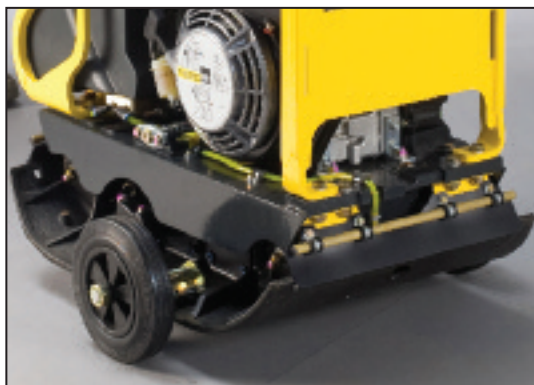
The transport wheels allow for one-person movement around the jobsite.