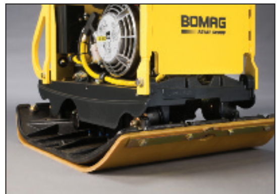
The Vulcolan mat helps avoid damage to paving stone surfaces.