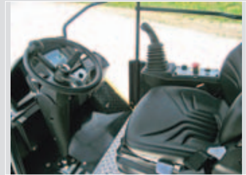
Redesigned Operator's Station for Simplified Operation and Increased Comfort