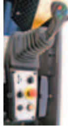
Ergonomic Layout of Controls Provides Precise Operation