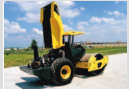
Vertically Opening Hood for Maximum Serviceability