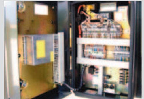
Centralized Electronics for Ease of Servicing and Troubleshooting