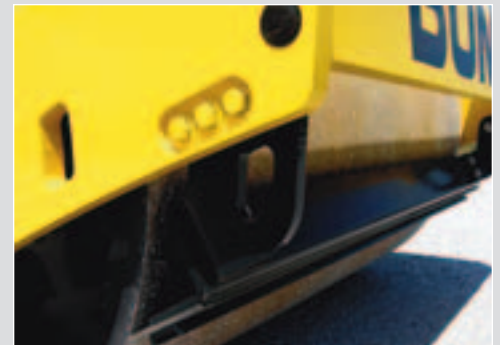
Redesigned Front Frame and Scraper Design for Improved Performance

With these features and many more, it's easy to see why these models maintain a high residual value while delivering lower lifetime operating costs.