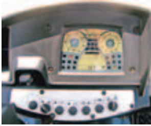
Dash display shown is typical for DH and PDH models