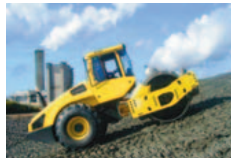
BW213 PDH-4 w/ optional cabin