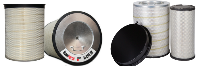
Typical 'Axial Seal' Design

**Filter kit number AA2990NF contains the AF27993NF primary and AF27994 secondary filters.