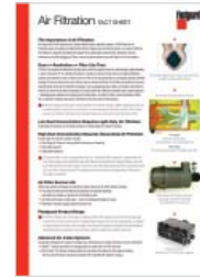
Air Filtration LT36178