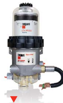
Advanced: All-in-One remote mount Fuel Management System