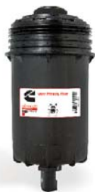
Economic: New generation composite type Fuel/Water Separator with serviceable cartridge element