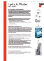
Hydraulic Filtration LT36182