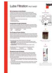
Lube Filtration LT36180