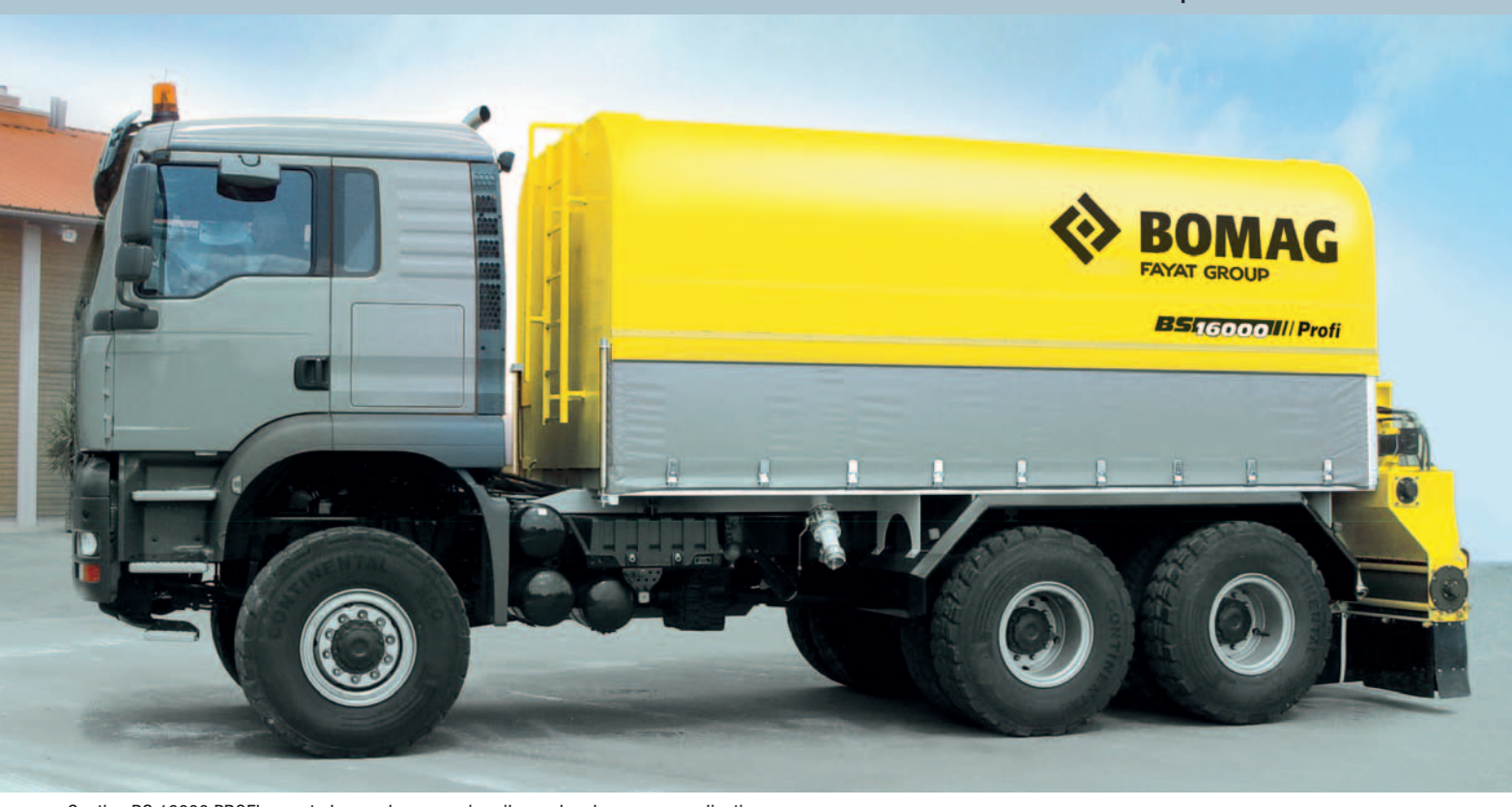
Caption BS 16000 PROFI mounted spreaders are primarily used on large area applications.