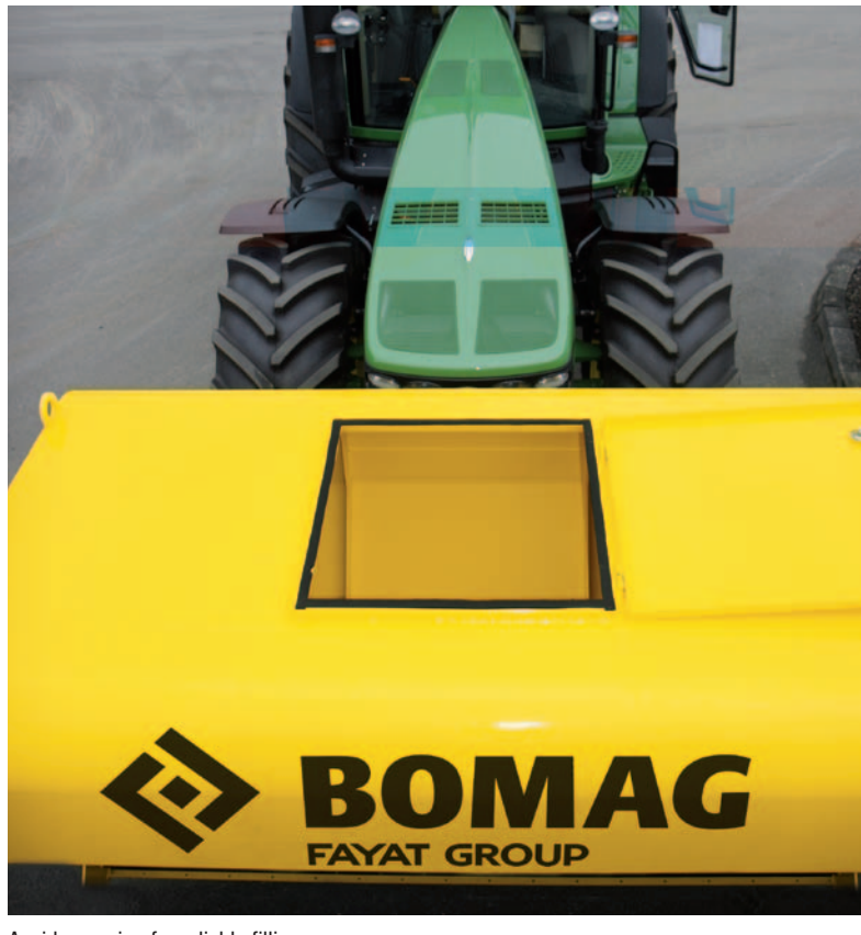
A wide opening for reliable filling.

The BS 3200, in combination with the BOMAG BSF 2500 stabilizer, forms a powerful stabilising train to treat weak soils especially on difficult sites.