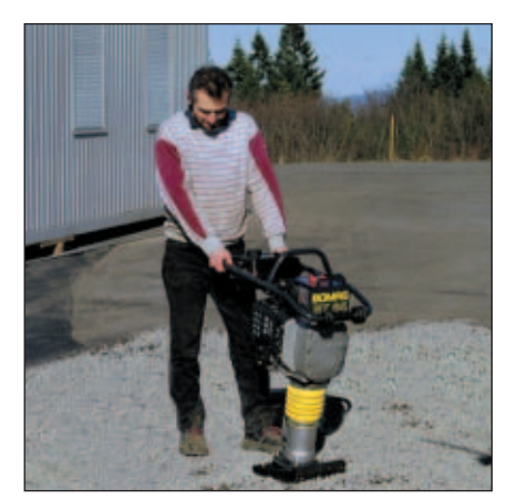
The features of the BT 60/4: low fuel consumption, quiet, low-pollutant and powerful.

The BT 80 D is used for applications on soils which are difficult to compact.