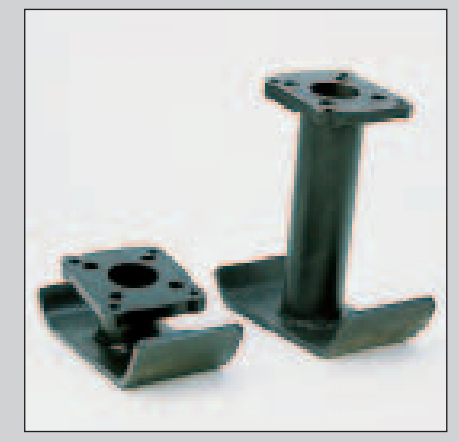
Tamping feet extension legs for operation in narrow, deep trenches.