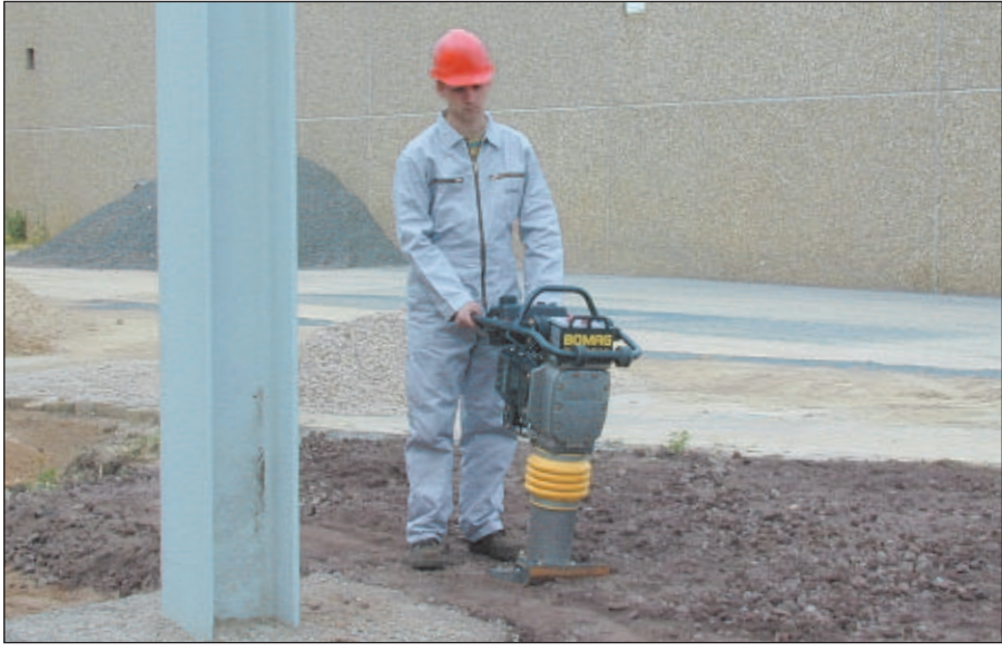
The BT 65/4 has extra performance and excellent travel characteristics.

their low fuel consumption. They are ideally suited for use in residential areas and excavation work. Trench work means confined conditions, engine noise risks amplified by reverberation from side walls and also the risks to safety of exhaust gas caused by poor air circulation within the trench itself. But with 4-stroke tampers, these problems can be substantially reduced and the hazards to the operator greatly reduced.