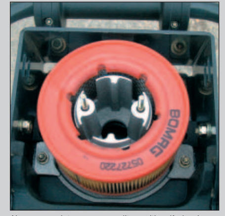
Near-zero maintenance expenditure with self-cleaning air filter housing and large air filter element.