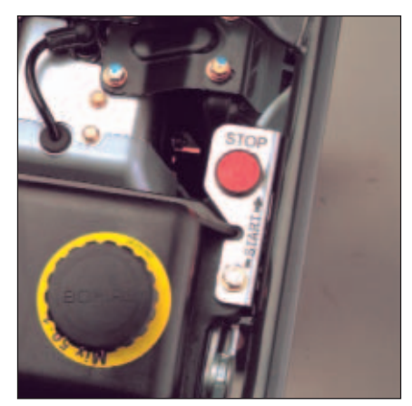
Operational safety: engine stop switch integrated into the handle