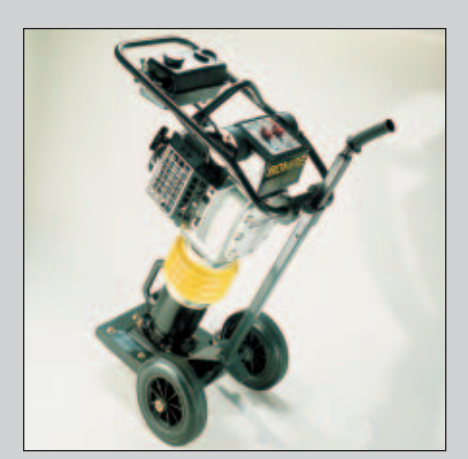
Transport trolley option for simple, rapid transport on site.