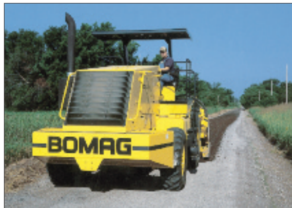
MPH362R-2 hard at work on a secondary road.

With the BOMAG MPH 362 & 364-2 Recycler, old and deteriorated asphalt pavements can be cut, pulverized and mixed with new binding agents. This RAP ( Recycled Asphalt Product) material is reused to provide a new road base material. This ecological and economical alternative of recycling pre-existing surfaces offers a cost effective solution to road maintenance.