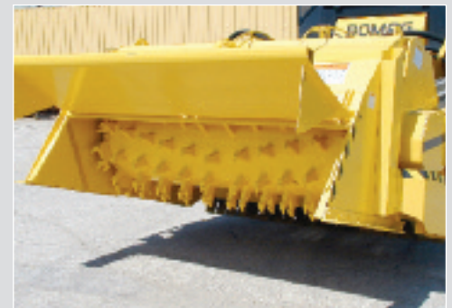
Easy and convenient replacement of cutting teeth without special tools.