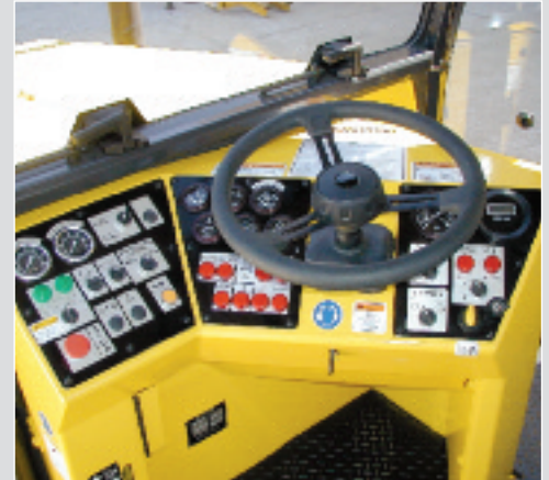
Convenient positioning of operational controls and indicators for increased comfort and productivity.