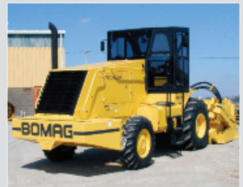
MPH362-2 shown with optional all-weather cab and air conditioning.

With these features and many more, it's easy to see why these models maintain a high residual value while delivering lower lifetime operating costs.