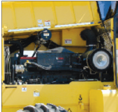
Wide opening hoods and access doors provide easy access to maintenance items and for cleaning purposes.