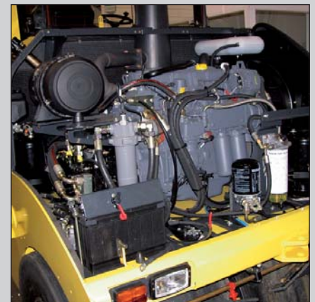
Easy and quick to service: The engine is easily accessible from all sides.