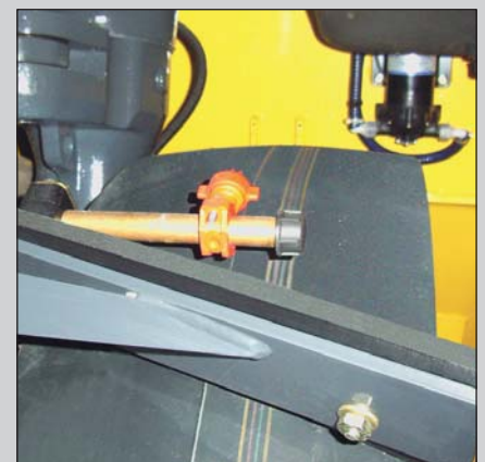
Standard equipment: pressurized sprinkling produces even wetting – regardless of gradients or water tank level.