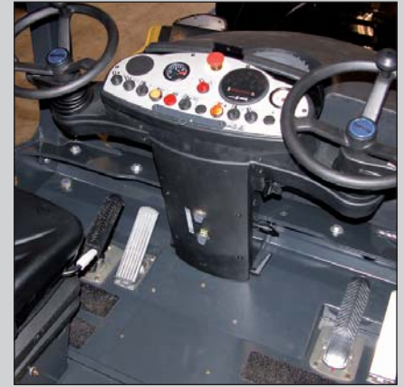
Two complete operator platforms with swivel/sliding seat make work more efficient and give good visibility.

The BW 24 RH and BW 27 RH BOMAG rollers can be adjusted to provide the specified weight for the job. To achieve this, different ballasting options are available. The rollers can be pre-ballasted with individual weights (attached under the frame). The large ballast space (approx. 3.5 m 3 ) is usually filled with sand or steel scrap for flexible weight adjustment. With the watertight, welded frame option, the rollers can also be ballasted with water.