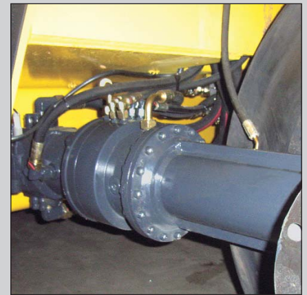
Sensitive speed control using a hydrostatic drive.