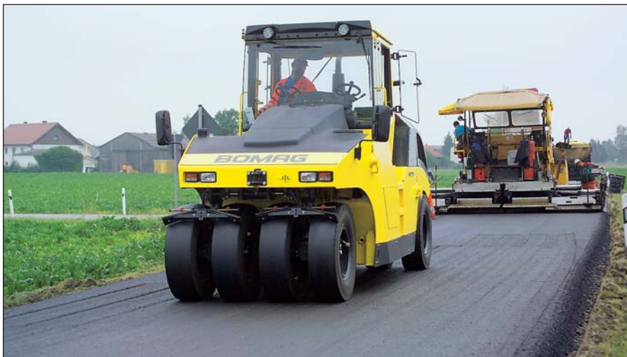
The BW 24 RH and BW 27 RH are flexible pneumatic tyred rollers for compaction work in asphalt and earthworks.

Pneumatic tyred rollers achieve a high level of compaction quality from the kneading and rolling effect of the wheels. Highly uniform compaction is produced which also gives a dense finish at the surface. The heavy weight of the rollers (up to 27 t) generates a vertical pressure combined with horizontal forces acting in all directions beneath the tyres.