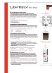
Lube Filtration LT36180