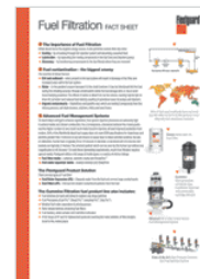
Fuel Filtration LT36179