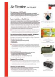
Air Filtration LT36178