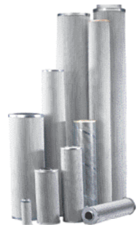
Fleetguard Hydraulic Filters