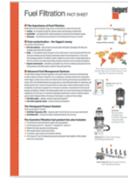
Fuel Filtration LT36179