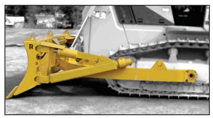
Perfect for rugged road building and pipeline applications.