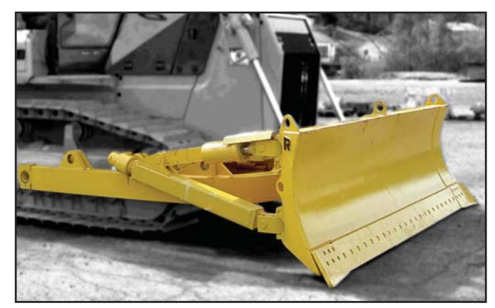
Angle blade, brace group and c-frame.