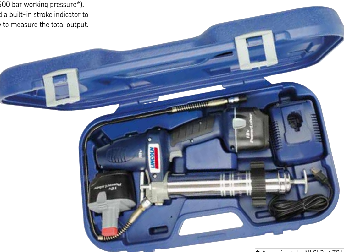
* Approximately, NLGI 2 at 70 bar backpressure

The PowerLuber's balanced design and padded grip make this tool comfortable and easy to use. Packed in a heavy-duty compact case molded from impact- and stainresistant plastic, this package comes complete with the PowerLuber grease gun and battery, a 230 V one-hour "smart" charger, an additional battery and a 30 inch flex hose with spring guard.